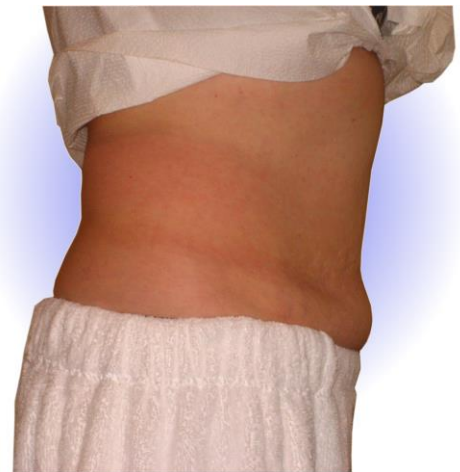
After 11 VelaShape Treatments